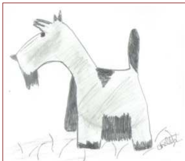
Chelsea, 8th grade